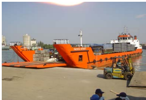
L/C Pacific Spirit fully loaded 31 May 06

The WFPSS Port Captain based in Nias undertook a mission to Sirombu to assess potential landing sites along the beach.