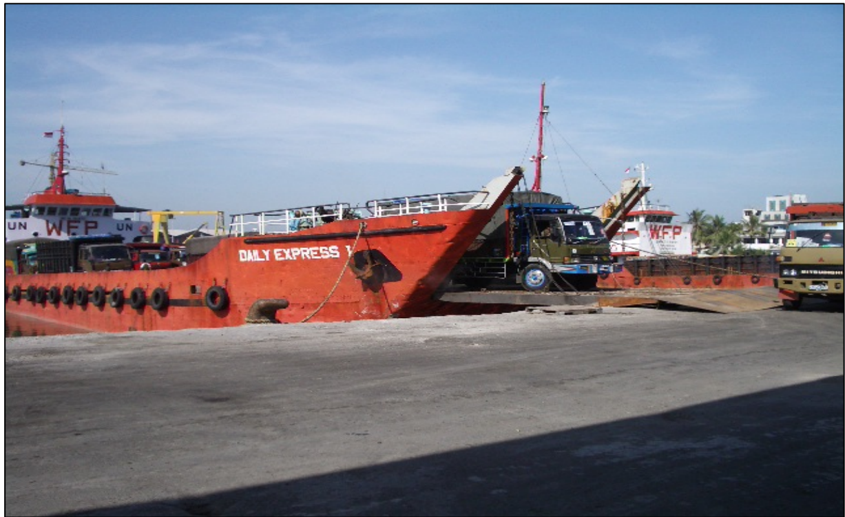
Daily Express and Sumber Power in Belawan on 28 June 2006