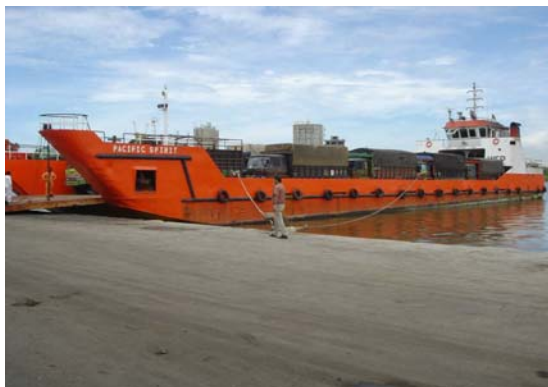
L/C Pacific Spirit loading in Belawan Port, 15 May 2006

Currently the team has a Port Captain, staff to handle bunkering, Agents and Stevedores on-site in Jakarta for the loading of the upcoming vessel.