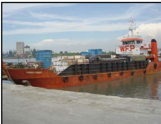
*Sumber Power Fully Loaded 17 June

Additionally, WFP Shipping Service will begin implementing cost recovery as early as August 2006. A complete list of rates will be released shortly.