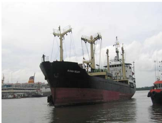
*Bunja Sejati arriving in Belawan 7 July 2006

On behalf of several agencies that are planning work on the island of Nias, a team from WFPSS Banda Aceh along with a civil engineer working with BRR will travel to the island next week to conduct an assessment of potential landing sites and road accessibility. The team plans to visit the following sub-districts: Afulu, Alasa, Bawolato, Gido, Gunung Sitoli, Idano Gawo, Lolofitu, Moi, Lotu, Mandrehe, Namohalu Esiwa, Sirombu, Tuhemberua, Mandrehe, Lahewa and Teluk Dalam.