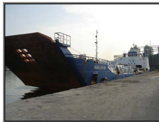
* LCT NIAGA JAYA 99: Belawan 1 st June

As of 12 June 2006, WFPSS has 225,459 MT / 45,327 metres 3 of planned shipments in the pipeline. Planned shipments are based on submissions by agencies of what they intend on shipping throughout the life-cycle of their projects. Current plans include shipments through March 2007.