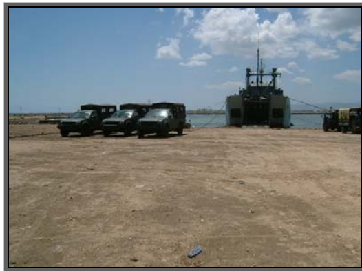
*New landing ramp – Ulee Lheue Port

Clearance for the use of the new landing ramp in Ulee Lheue Port has been coordinated and approved for immediate use. This temporary ramp was designed and built by UNDP for use by WFPSS and other agencies for the transportation of reconstruction materials during this rehabilitation and reconstruction phase.