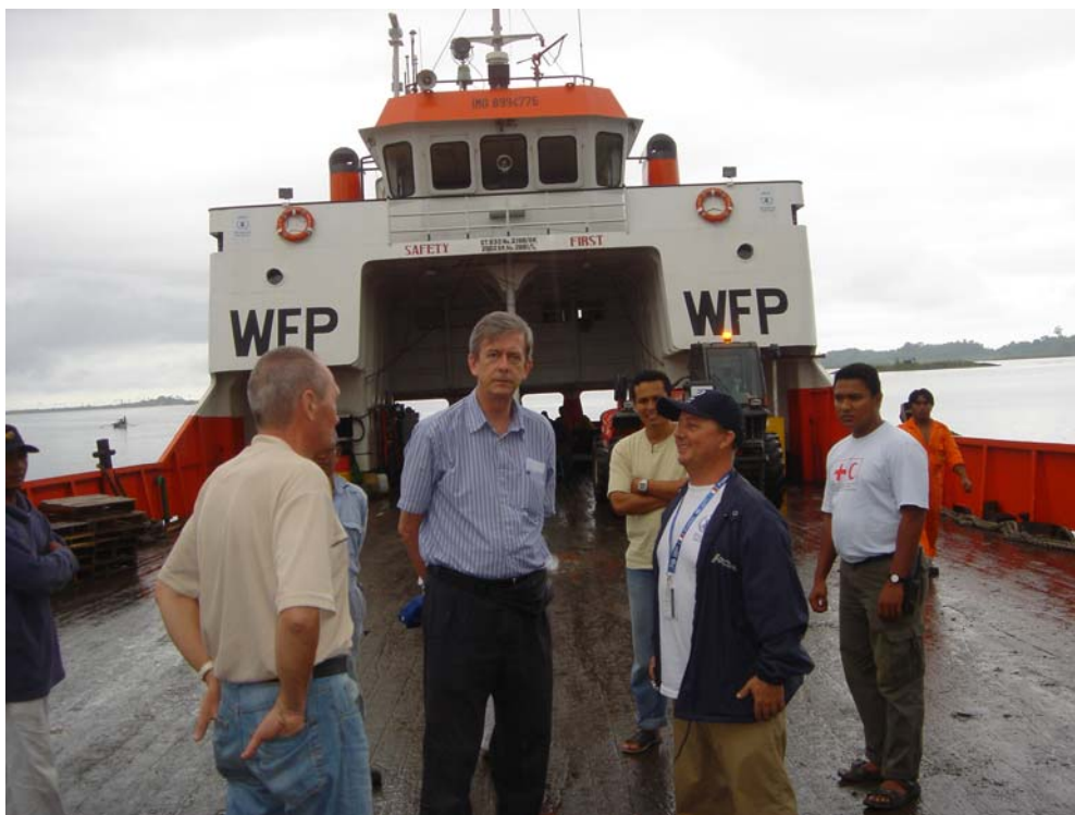
Dutch Ambassador's visit to Simeulue, July 10 2006