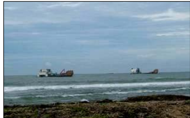
Labitra Hanny (right) towing Labitra Ardinda (left) leaving Calang for repair.

The Shipping Service has experienced many difficulties during the Monsoon season, especially for the inter island trade around Nias and lately the LCT Labitra Adinda suffered some damage in Calang. Its rudders and propellers were damaged due to heavy pounding on to the Rigah discharge ramp in a heavy swell when her bow lines snapped. The vessel is under tow to a repair yard.