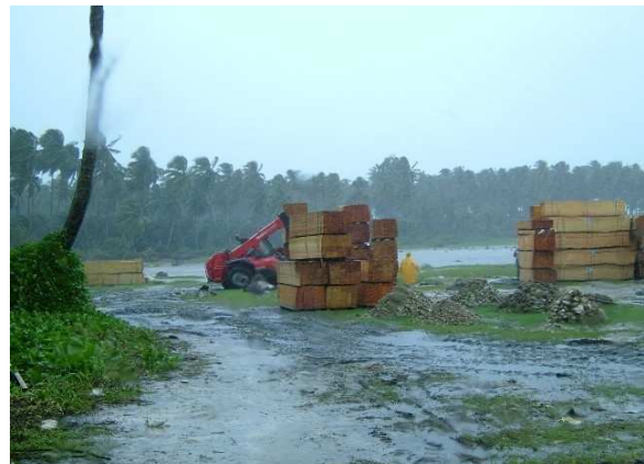
Two (2) Forklifts Manitou discharged IFRC cargo in Nasrehue