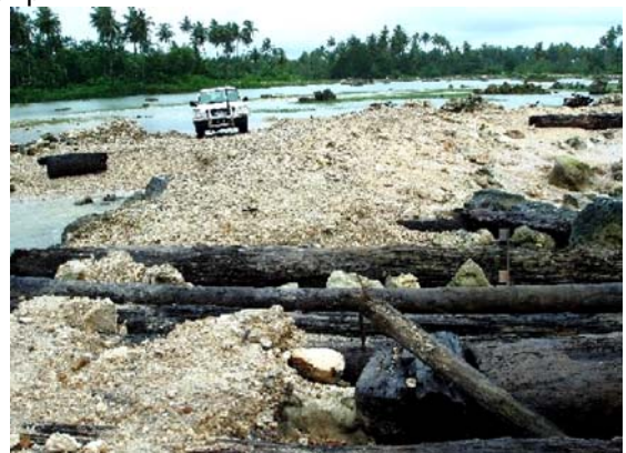
Lafakha Temporary Jetty

Upon request by IFRC, WFPSS conducted a survey to update current landing condition in Lafakha. The condition of the temporary jetty-ramp in Lafakha is very poor. It is not feasible to work with heavy cargo. The access to the temporary jetty-ramp is not wide enough. The ground is soft with holes. Old logs of ramp foundation exposed in some parts, which supposed to be well covered by hard sand and fine rocks. IFRC is going to repair the jetty-ramp.