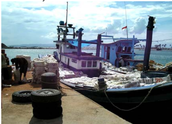
Packed bricks loaded manually to wooden coaster

On May 4 th 2007, WFPSS Banda Aceh Sr. Logistic Assistant reported the observation of commercial operator activities in Ulee Lheu. Most of commercial operators are using small wooden coasters. Loading and discharging are usually done manually.