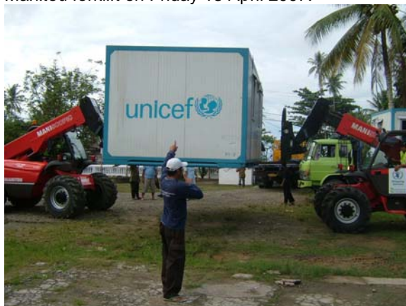
Two Manitou Forklift working intandem 2 Office container

WFPSS Nias offloaded 2 office container from road vehicles at the UNICEF compound, using two Manitou forklift on Friday 13 April 2007.