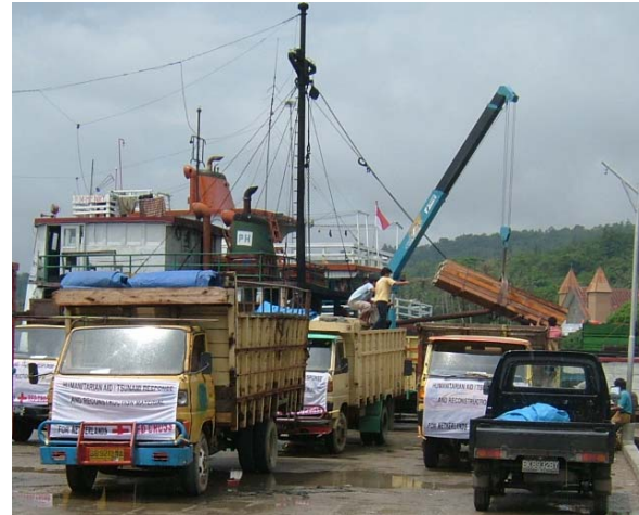
NRC timber discharged at Gunung Sitoli port

9 April 2007 : 300 m 3 of Timber loaded at Riau arrived at Gunung Sitoli port on the K.M Henry. The timber was consigned to Netherland Red Cross Nias. All timber was landed direct to colt diesel trucks and moved to Lahusa by road. The timber is for the construction material required to built houses in Lahusa.