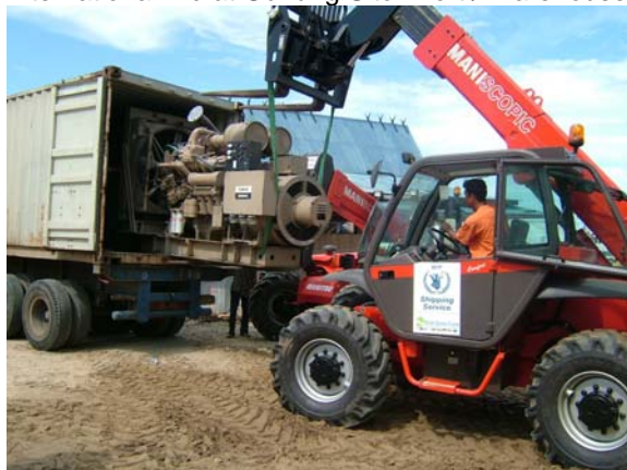
Two Manitou Forklift working intandem offload 2 Generator set

On Tuesday 10 April 2007 WFPSS Nias offloaded 2 Generator set (approximately 3 MT each) and Medical kit from a 40' foot container for International Aid at Gunung Sitoli Port / Warehouse