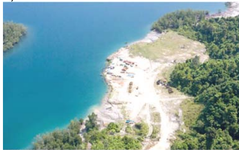
NW of Sibigu © Simeulue Reef Aerial - Simeulue 2 Feb 06

Simeulue: The IFRC is preparing to complete the Transitional Shelter programme on Simeulue with the distribution of the final 2,150 shelters. To enable the IFRC to distribute the shelters in the most economic method, various landing points have been identified and will need to be surveyed. On 20 March, IFRC sent a formal request to WFPSS to conduct a landing site assessment to ensure the capability of landing crafts in North West Sibigu, Simeulue. (2° 50' 52.5" N – 95° 52' 05.4" E).