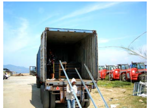
Unloading steel frames from 20" container

30 March 07: Steel frames shipped in containers, landed at Belawan and road transported to Banda Aceh. The containers were stripped in Ulee Lheue and shipped breakbulk on MV "Alaska" to Pulo Aceh.