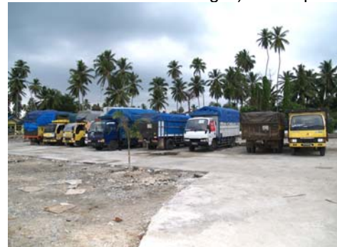
Trucks waiting to cross to Simeulue at Labuhan Haji Port

A cargo vessel movement survey was conducted to assess port activities along the west coast of Aceh on 20-22 March 2007. The survey team started from Lamno continued down through Calang, Meulaboh till Labuhan Haji. It was observed that Meulaboh port received large quantities of cement from Padang and the Cement Factory in Lhok Nga port/Banda Aceh. Trucks carrying IFRC temporary shelters were found out waiting at Labuhan Haji port for a week to get on to the ferry to cross to Simeulue. The ferry service between Labuhan Haji – Simeulue can take 10 -12 trucks (combined humanitarian and commercial cargos) each trip.