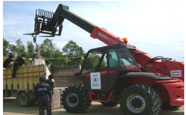
WFPSS Manitou Forklift loading CONCERN cargo to trucks