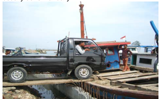
Mitsubishi Colt diesel loaded to wooden boat at Ulee Lheue Port, Banda Aceh

WFPSS Staff are monitoring cargo shipped by commercial operators. The observation has shown that most of commercial operators are using small wooden coasters. Loading and Discharging are usually done manually.