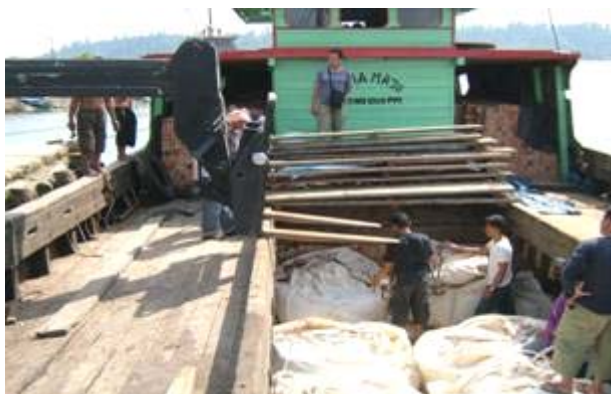
WFPSS Manitou Forklift is assisting discharging CONCERN cargo from a wooden coaster at MDF Jetty.

Simeulue: WFPSS Simeulue staff assisted discharging of CONCERN cargo from a wooden coaster at the MDF Jetty and loading onto trucks to be transported by land. Total cargo discharged 47 bags of sand. Each bag weights 1 ton. These sand bags were shipped from Sibolga (North Sumatera).