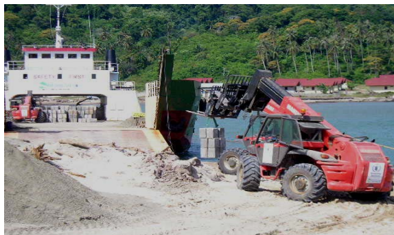
WFPSS manitou unloading ZTOF cargo at Pulo Aceh