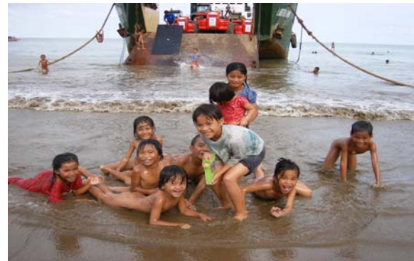
Kids playing near landing sites at Tagaule, Labitra Hanny at background

After Completing Discharge AMDA cargo at Tagaule from Labitra Hanny, Nias is waiting for another shipment from Belawan, which expected to arrive at 20 th Dec 06.