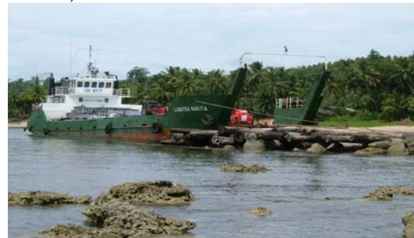
Labitra Nakita Discharging at Lafakha

After completing discharge Labitra Nakita and Niaga Jaya 12, Simeulue are waiting for Labitra Hanny from Belawan to Discharge IFRC cargo at Sinabang and Lafakha, ETA Simeulue 8-9 December 2006.