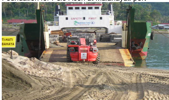
Labitra Adinda Discharging BRC cargo at Pulo Aceh

Banda Aceh are waiting for Labitra Adinda which is still unloading Zero to One Foundation at Pulo Aceh, to load more cargo from Zero to One Foundation for Pulo Aceh at Malahayati port