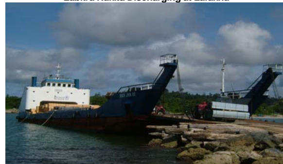
Niaga Jaya 12 Discharging at Lafakha