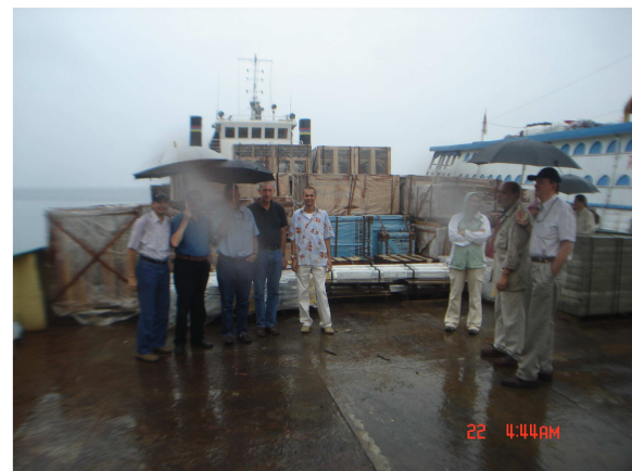
WFP Mission From Rome Visit at Nias

Labitra Hanny sailed noon time on WED 23rd.Nov .2006 to Lahusa and Tagaule carrying 163.470 M 3 cargo for NRC and 359.24 M 3 for AMDA. Port Captain together with 2 Logistic Assistants are on mission to Lahusa and Tagaule to supervise the cargo off-loading for NRC and AMDA. WFP PRRO have asked to ship 200 MT food items from Nias to Simeuleu