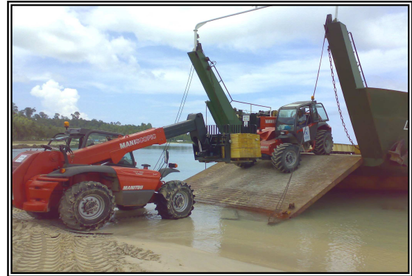
Two forklifts working together to discharge cargo at Langi

After discharging IFRC cargo from Labitra Adinda, Simeulue is currently waiting Niaga Jaya 12 to discharge another IFRC Cargo.