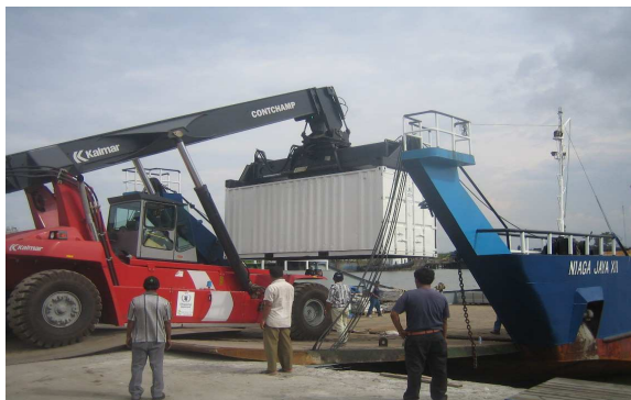
WFPSS successfully used 1 Kalmar reach stacker to load 2 containers on board Niaga Jaya 12.

For the next 3 weeks there are 6 loadings from Belawan, 4 for IFRC, 1 for Concern (to Sinabang) and 1 for NRC and UNHCR/AMDA (to Nias)