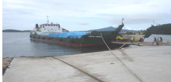
Labitra Adinda successfully discharges at newly constructed UNDP jetty, which is still partially incomplete.