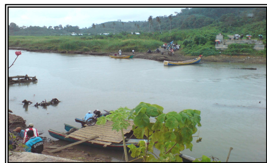
Bridge collapse at Krueng No, Aceh Jaya District

Currently, transportation from Calang to Lamno is affected by a collapsed bridge in Krueng No that was wiped away by the recent heavy rains in the mountain (24 October 2006). The location is about 50 Km from Calang, or 110 Km from Banda Aceh. No car can pass at the moment, however, there is a raft for people and motorcycles to cross the river. BRR informed that they have coordinated delivery of a 30 m span Bailey bridge. It is currently under the process of mobilization to the bridge location from Banda Aceh by TNI (Zeni-Engineering Unit) and Wijaya Karya (WIKI) Contractor. If there are no other problems, once on location, it should take around 5 days to complete the installation of the Bailey bridge.