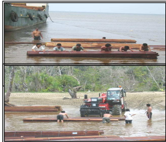
Labitra Hanny discharging AMDA timber cargo in Tagaule on 23 Oct 06.

Vessel beached the following morning at 09:00 but had to wait until 21:00 to get close enough to the beach to operate Forklifts. We worked at night until 00:30 making use of new portable spotlights. Sailed to Tagaule Village 2 the following day and beached 08:45 on the muddy beach – dropped timber in water and hand carried 14 pallets of joinery (doors, windows, frames and ventilation grids).