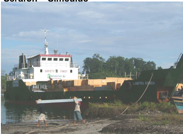
Labitra Adinda discharging IFRC timbers cargo in Serafon on 16 Oct 06.

IFRC discharging timbers cargo with Labitra Adinda to Serafon on 16 Oct. 06 it was her first time discharging in Serafon and the discharging manually because the forklift have problem to get on board because the soil surface was too wet.