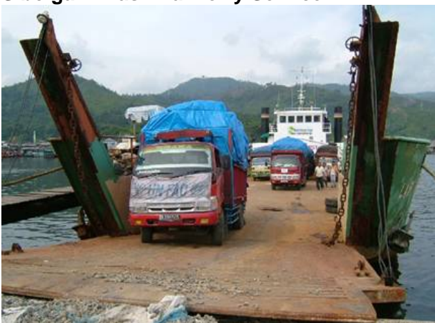
Labitra Hanny loading FAO's seeds cargo in Sibolga on 10 Oct 06.

UN FAO placed 9 trucks of seeds cargo on Labitra Hanny to cross to Gunung Sitoli on 10 Oct. 06. It was her first sailing since she was stationed in Sibolga on 3 Oct.