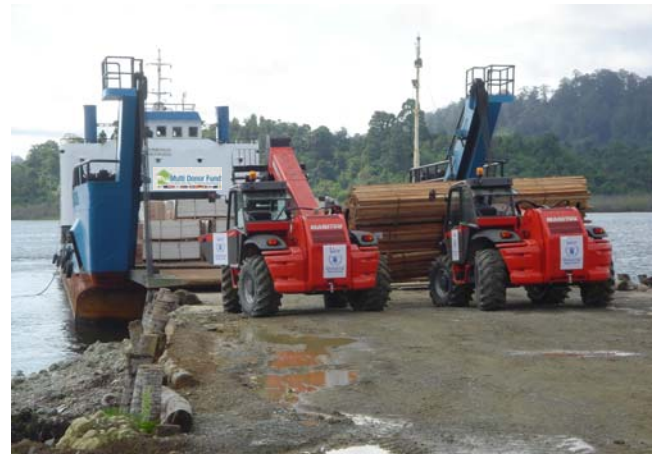
Niaga Jaya XII offloading Concern's cargo in MDF Jetty, Sinabang, Simuelue Island – 27 Sep 06

The new Jetty was built by the Service at the end of July, with a trial discharge on 25 August. An official name – “MDF Jetty in Sinabang” is been approved now to be used in the future. The new Jetty is proving to be a valuable facility in Sinabang, which reduces the congestion in the existing port, and provides a safer environment for discharging.