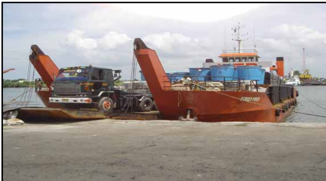
Figure 1: LC Sumber Power loading cargo

In an effort to properly plan for future needs, it is important for customers to provide WFP Shipping Service with their 3-month Pipeline Projections. We urge you to include us in your planning cycle at the earliest stage possible so we can help to meet logistical challenges. In addition, users should strive to complete the Cargo Booking Forms in a timely fashion, ensuring all relative information is included so as to minimize delays. Both forms are available on our website at http://www.wfpss.com .