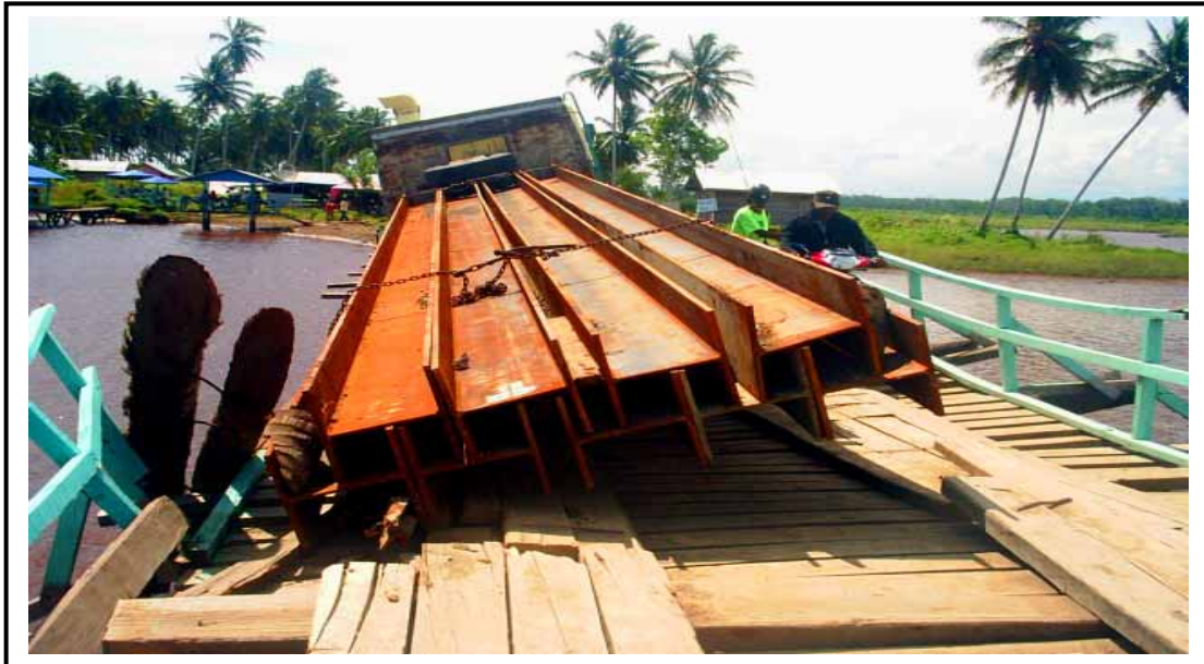
Figure 2: Broken Bridge, Sama Tiga, 7/5/06

A team from WFP Shipping Service visited Samatiga on the 6 th of May to conduct a road assessment. The team found that the wooden bridge in Samatiga had collapsed as a truck carrying in excess of the maximum load (8MT) tried to pass.