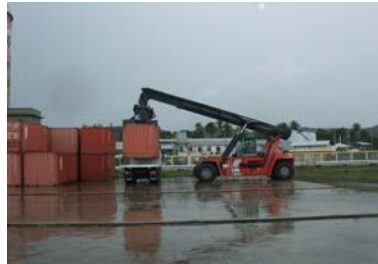
Container Depo at Malahayati

to entrepreneurs from Aceh, were discharged at Belawan Port. That was the first sail for the ship which took the route from Tanjung Priok – Belawan – Kreung Geukeh to Malahayati port, operated by PT. Jakarta D'Loyd.