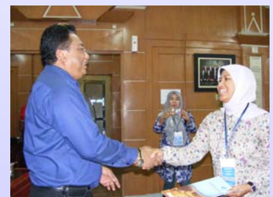
Hand out certificate