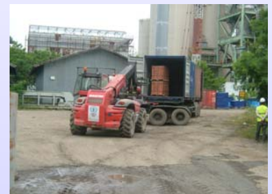
PT. SAI - Lafarge Operations

One Manitou forklift unit is being used by PT. Semen Andalas Indonesia - Lafarge on a continuous basis. The units are used to handle project-related materials for factory development, consigned by road in containers from Medan.