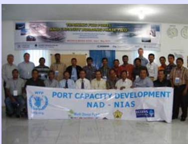
Operations and Maintenance

Module 1 of the training commenced with a "Monitoring and Evaluation" course, from 12 th - 17 th April 2010. The training took place in Hotel Madani Medan, and was attended by 23 participants from 18 ports Aceh - Nias and Government office. Invitations were sent to 25 participants and two observers from University of Syiah Kuala.