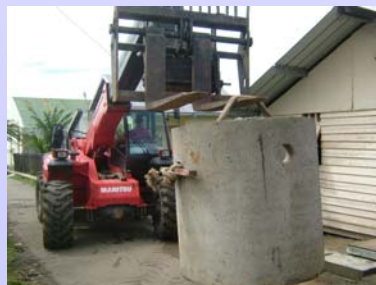
UN Habitat Watsan

UN Habitat Banda Aceh are using two Manitou forklift units to support their Water Sanitation project in Banda Aceh and nearby Aceh Besar. The equipment is used in tandem with the Duramats.