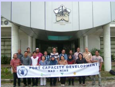
Computer Training Class

Two remaining classes will be conducted in the UN Compound meeting room. The facilities in UNSYIAH Kuala will be vacated by end of December 2009.