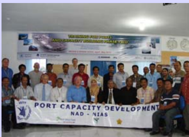
Containerization and International Best Practices

The last module of the training commenced with a "Containerization and International Best Practices" course, from 31 st May – 5 th June 2010. The training took place in the UN Compound, and was attended by 21 participants from related ports in Aceh – Nias, BPKS Sabang (Management Board of Sabang Free Port and Free Trade Zone) and the Government office. Invitations were sent to 25 participants and two observers from University of Syiah Kuala.