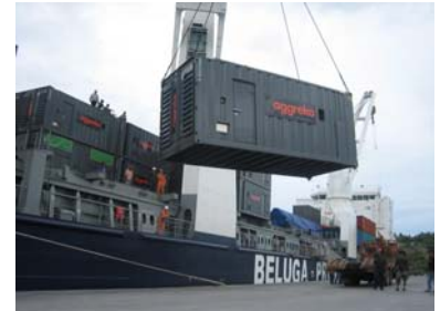
Containers at Malahayati Port

port, operated by Beluga Bremen, Germany.