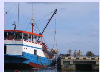
Tapak Tuan Port

The Monitoring and Evaluation team has completed visits to 18 ports in Aceh - Nias to meet with port staff, collecting port data information and also receiving input from participants regarding phase one of the port training. The last schedule is as follows: Meulaboh port (24 May); Susoh port (25 May); Labuhan Haji port (25 May); Tapak Tuan port (25 May); Singkil Port (26 May); Calang port (27 May).