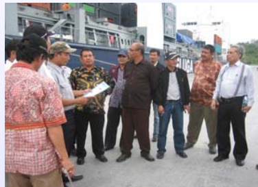
Field Trip to Malahayati Port