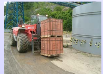
PT. SAI – Lafarge Operations

Two Manitou forklift units are being used by PT. Semen Andalas Indonesia - Lafarge on a continuous basis. The units are used to handle project related materials for the factory development, consigned by road in containers from Medan