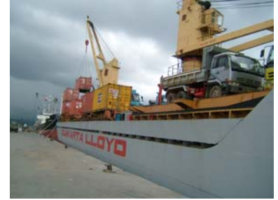
Containers and Trucks at Malahayati Port