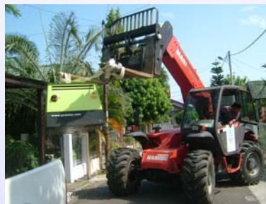
Unloading Generator at Lamlagang

11 March 2010 in order to handle a generator at the UN DSS guest house in Lamlagang, Banda Aceh.