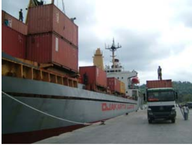
Containers at Malahayati Port