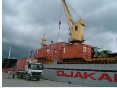
Containers at Malahayati Port