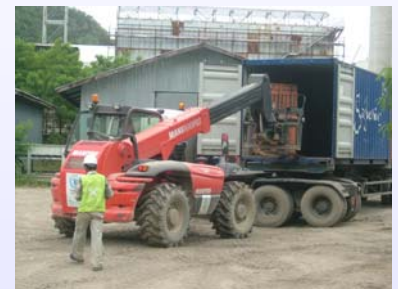
PT. SAI - Lafarge Operations

development, arriving by road in containers.