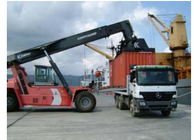
Containers at Malahayati Port

Padang – to Malahayati port, operated by PT. Jakarta D'Loyd. Prior to sailing back to Tanjung Priok port the vessel loaded with 46 empty x 20' feet and 35 of trucks on wheels.