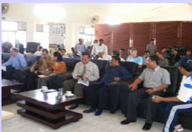
Closing ceremony Port Capacity Development phase one

Phase One of the WFP LSU Port Training ended on 17 December 2009. A field trip was conducted visiting the port of Belawan with the theme "Roles and Responsibilities of a Well-Managed Port". In all, 36 participants were selected from 232 students to join the field trip. The field trip permitted participants to understand the rolls and responsibilities of international ports, service providers, input to the successful Field trip was received from Pelindo and Samudera. The Port of Belawan was an important gateway for the WFP SS shipping operations in 2006