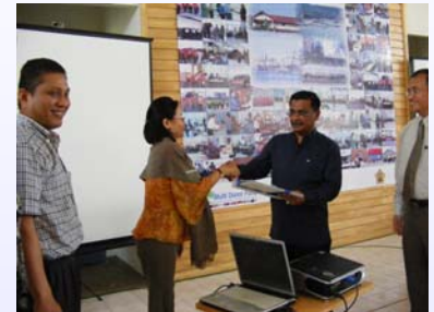
Symbolic handover of the port training course material

Phase two of the Port Capacity Development project consisting of three additional modules: Containerization; Operation and Maintenance; and Monitoring and Evaluation. The procurement procedures have been finalized and a successful bidder has been identified.