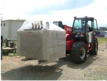
Sultan Iskandar Muda air port

Sempana) utilized a Manitou forklift for handling electrical panels at Sultan Iskandar Muda air port.