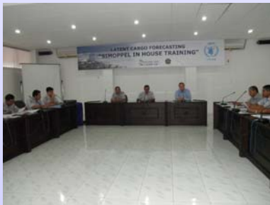
Inauguration Simoppel Training at Dinas Perhubungan Office

On 12 th – 13 th July 2010, Dinas Perhubungan has conducted SIMOPPEL in house training for all ports in Aceh supported and funded by World Food Programme Logistics Support Unit with theme "Technical Guidelines of SIMOPPEL to Collate Ports Performances Data in Aceh Linked to Latent Cargo Forecasting – WFP LSU".