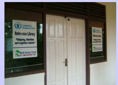
Reference Library Shipping, Maritime and Logistics Centre

All course material has been placed in "Reference Library Shipping, Maritime and Logistics Centre" located in UNSYIAH Training Centre, the vision is to establish a faculty or a programme titled ' Shipping, Logistics and Maritime Studies ' which UNSYIAH expects to be implement in the near future.