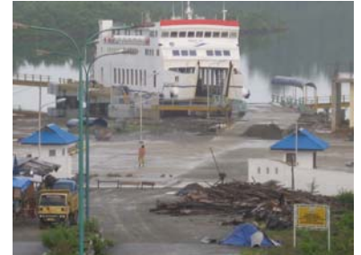
KMP. Teluk Singkil

is undergoing annual surveys maintenance, meanwhile KMP. Teluk Sinabang serves Labuhan Haji – Sinabang.