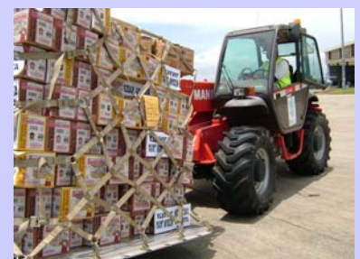
Assisting Food Delivery

The WFP LSU emergency response team, comprising two Land Cruiser and four units Manitou forklift mobilized to Padang earlier have now returned to Banda Aceh. Logistics Officer in charge of Padang logistics cluster office and remaining UN vehicles, one land cruiser, one double cabin and duramats are scheduled to return to Banda Aceh mid December 2009.