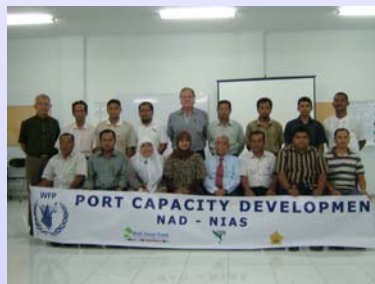
Claims Management Class

Approaching Idul Adha holiday the Port Training will be suspended from 23 November to 04 December 2009, this time will be used to update all data.