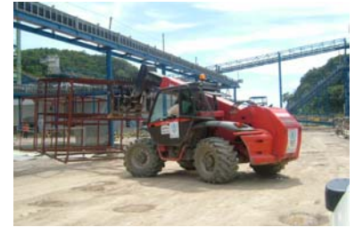
PT. SAI – Lafarge operations

One unit Manitou forklift is being used by PT. Semen Andalas Indonesia - Lafarge on a continuous basis, to discharge the project materials for the factory development, from containers into the warehouse.