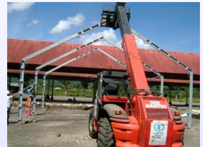
Manitou forklift at Ketaping Bus Station

Padang, coordinated by World Food Programme