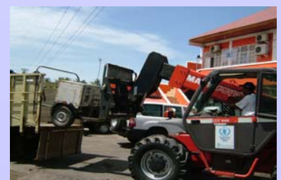
Manitou forklift in Padang

The four units Manitou forklift positioned in Padang were strategically located in different operation areas, one unit stationed at Ketaping Bus station, to assist erecting and assembling Inter Agency Wikhall, one unit at WFP Warehouse to handle the unloading cargo from trucks, two others units stationed at Minang Kabau Civilian Airport and Tabing Military Airport to handle the incoming humanitarian cargo from the aircraft.