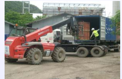
PT. SAI - Lafarge operations

Three units Manitou forklift are being used by PT. Semen Andalas Indonesia - Lafarge on a continuous basis, to discharge the project materials for the factory development, from container into the warehouse.