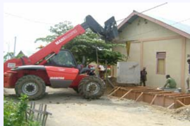
UN Habitat Sanitation Programme

UN Habitat Banda Aceh are using one unit Manitou fork-lift on a regular basis to support their Water Sanitation project in Banda Aceh and nearby Aceh Besar. The equipment is used in tandem with the Duramats.