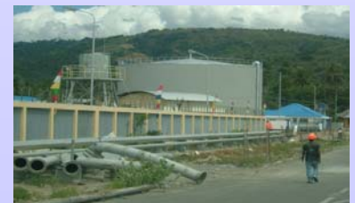
Bitumen Shore Tank

The Bitumen shore tank with a holding capacity 3000 Mt is under trial operation, the installation of shore side pipes from the quay side to the shore tanks are being completed.