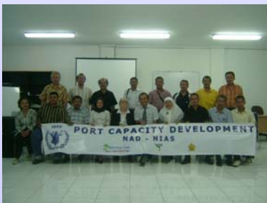
Group photo at end of class

The Port Management Training was suspended for the month of Ramadhan recommencing on the 28 th of September 2009.