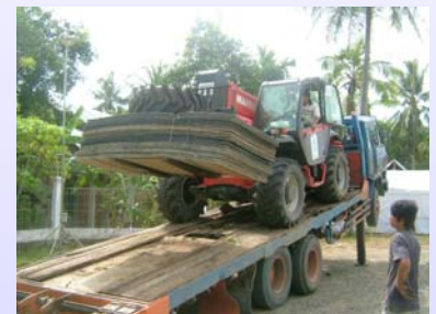
Manitou Forklifts from Islands

arrived from Nias Island on 17 July and Three units arrived from Simeulue Island on 22 July 2009. All Manitou forklifts are stored at WFP LSU area within the UNICEF managed warehouse complex.