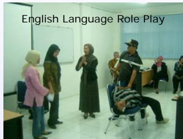
English Language Role Play

The training commenced on 16 th December 2008, there are 34 course modules remaining. Training is scheduled through to the end of December 2009.