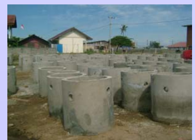
UN Habitat Sanitation Programme

On 11 August 09, WFP LSU and UN Habitat conducted joint assessments to consider the use of the Manitou forklifts to support their sanitation programme in Banda Aceh and nearby Aceh Besar.