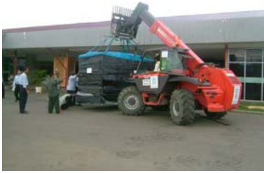
X-ray machine at Airport

On 22 July 09, a private contractor (PT. Citra 91) utilized one Manitou forklift to support the unloading one unit X-ray machine at Airport Sultan Iskandar Muda.