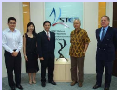
STET Maritime Singapore Office

On 27 July 2009, WFP LSU and STET Maritime Singapore conducted the 2 nd quarterly meeting hosted at STET Maritime Singapore offices to update and review past months activities. The first quarterly meeting was conducted at WFP LSU offices, Banda Aceh.