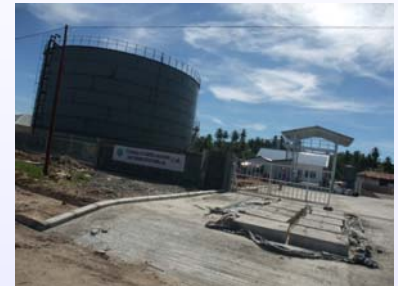
Bitumen storage tanks

Reclamation for open storage area of 72,981 m 2 and retaining wall is still under construction. The building of the Bitumen storage tanks to the rear of the harbour are proceeding well.