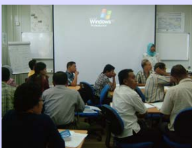
Additional Class at WFP LSU Office

In May 2009 the Port Training was in recess for the duration of the month in the order to allow for an evaluation period. The Port Training will resume on 08 June 2009. In the meantime one additional classroom to accommodate 20 participants for the English Languages modules for the participants from Nias and Simeulue was set up within the UN Compound in Jl. Jend. Sudirman no. 15 Geuce Inem Banda Aceh.