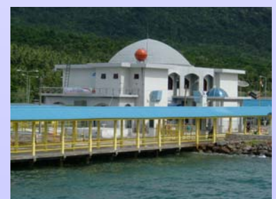
New Passengers Terminal

This new passenger terminal and parking area was funded from APBN Budget.