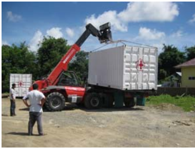
PMI Open Storage

Indonesia (PMI) on 08 – 09 June 09, to assist off-loading of 3x20ft containers onto a truck at the PMI open storage area.