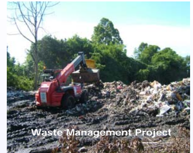
Waste Management Project

Equipment is rented out to PT Adhi Karya, Help and UNDP Waste management project.