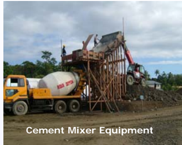
Cement Mixer Equipment

The units are used in support of the Port reconstruction projects, amongst other tasks being cement laying operations.