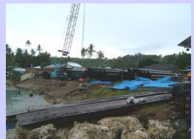
New Jetty at Gunung Sitoli

The Gunung Sitoli port is undergoing construction by PT.Adhi karya. The new jetty will be: Length 86 m, Width 20 m, draft 9-10 m.