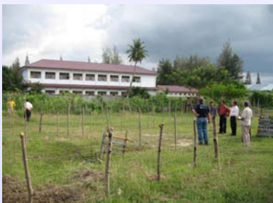
Land space site planned for erecting rubhalls

WFP LSU and the Rector of the University of Syiah Kuala have met to discuss and explore the possibility of utilizing University land for erecting five rubhalls for use as Port training facilities.