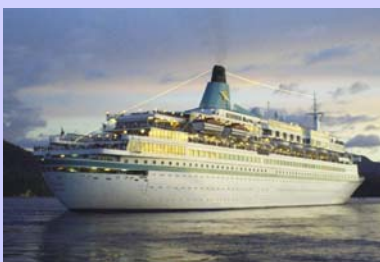
MV. Albatros Nassau

The cruise ship MV. Albatros Nassau, with 400 tourists and 400 crew, visited Sabang Port on 1 st April 08. Her next destination is Colombo, Sri Lanka.