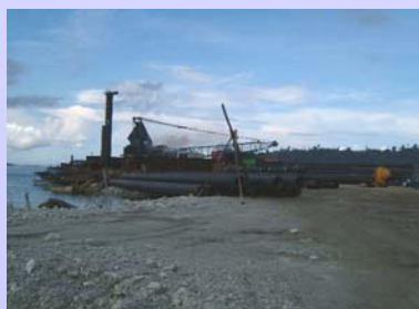
New Cargo Port at Langenget

Currently two small ports, including port office facilities, are under construction in Sinaban: a new ferry port at Kolok Baru village, with a draft of seven metre in high water, and a general cargo port at Langenget village. Both of these projects are funded by BRR.