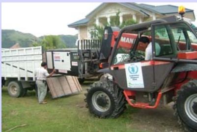
Cargo handled at Care International warehouse

On 13 March, Care International Banda Aceh utilized one Manitou forklift to support the loading and transport of one generator unit onto a truck from the Care International warehouse at Lhoknga to their office at Lamteumen.