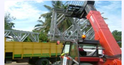
Manitou forklift unload part of Bailey bridge

BENTIAN) rented one Manitou forklift for handling construction equipment for bridge construction in Nias.