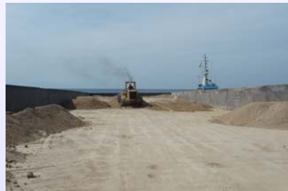
Pozolan (Cement Material)

bulk in a second export shipment. They utilized a conventional vessel, with Sri Lanka as the destination. PT. PELNI is the appointed shipping agent.