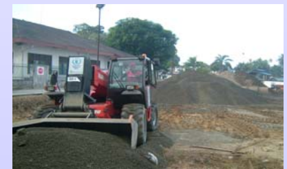
Cargo Handled at Gunung Sitoli port

A private contractor (PT. Adhi karya) rented one Manitou forklift with bucket for handling construction material at Gunung Sitoli port.