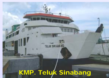
KMP. Teluk Sinabang

New ferry vessel (KMP. Teluk Sinabang) arrived in Simeulue on 9 February 08. The new ferry vessel has capacity to transport 14 trucks, 4 cars and 300 passengers. Vessel LOA = 54.50 m, LOB = 14 m, GRT = 750