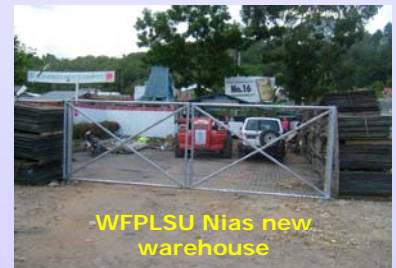
WFPLSU Nias new warehouse

On 12 February 2008, WFPLSU Nias handed over surplus equipment to the BRR regional office in Nias. The handover is in support of the BRR operation in Nias.