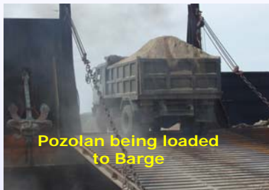
Pozolan being loaded to Barge

Malahayati port commences export shipment. Bulk shipment of Pozolan (cement material) is being shipped on barge from Malahayati port, to be discharged in Penang, Malaysia.