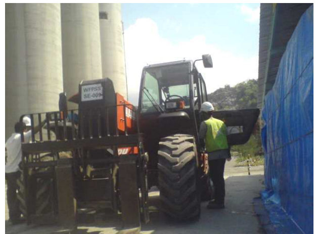
Cement Factory at Lhoknga

A PT. Citra Duta Utama is renting one Manitou Forklift, to support discharging of cement in bags at PT. Semen Andalas Indonesia / Lafarge project.