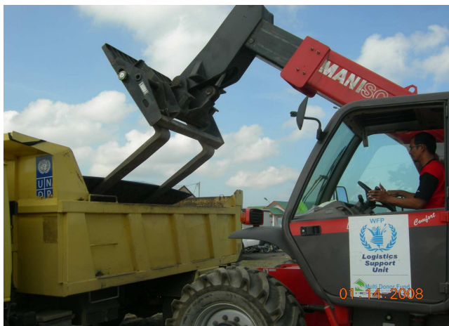
Transferring Duramats at Ulee Lheue Compound

On 14 - 15 January 2008, WFP LSU handed over 125 Duramat units to the Local Government through UNDP, in support of their waste management project.