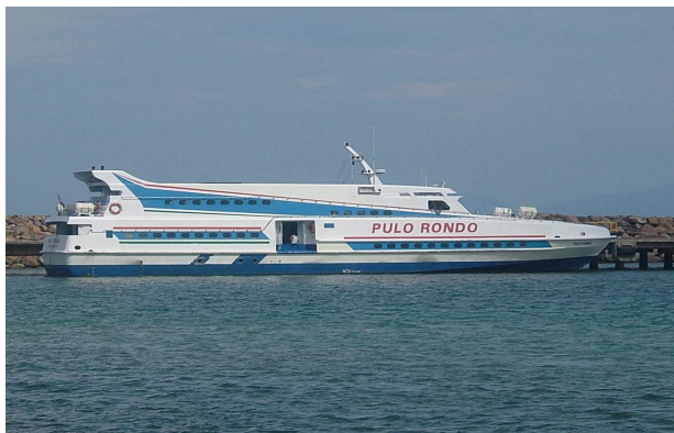
'Alongside Ulee Lhee Harbour'

Fast ferry KMP. Pulo Rondo is currently non operational, moored along side in Ulee Lheue wharf, undergoing main engine overhaul since December 02, 2007. During the maintenance, the fast ferry service between Banda Aceh – Sabang is served by KMP. Baruna Duta. The ferry schedules remain unchanged, the ferry operator adding an extra voyage for KMP. Baruna Duta to cover KMP. Pulo Rondo. KMP. Pulo Rondo will be operational on the December 23, 2007.