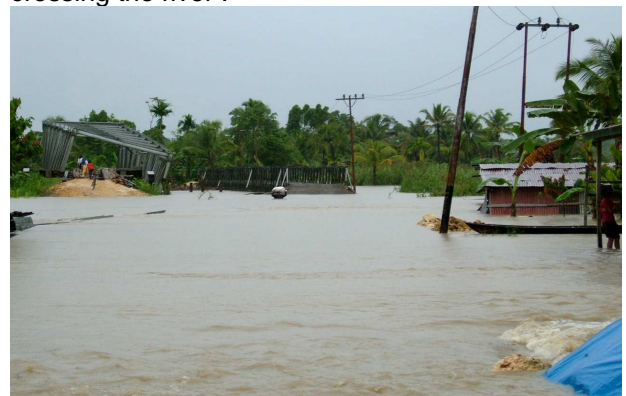
Flooded River in Nias

The recent floods in Nias (road from Moawe to Lahewa) on December 15 – 16, 2007 affected WFP LSU operation in Lahewa, our vehicles and operators were delayed in commencing the operation requested CV. Tujuh Serangka, to unload building materials, as trucks were impeded in crossing the river.