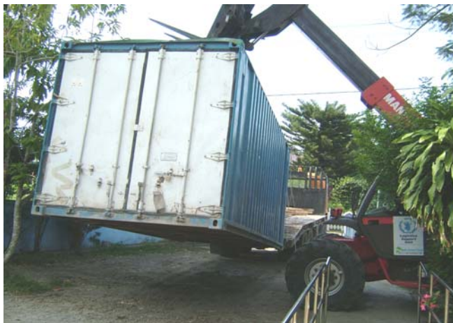
Versatile Manitou all terrain equipment ' handling ' containers.

Handicap International utilized one Manitou, to support with transportation and handling of containers from Atlas Logistique warehouse to their premises.